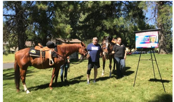
A photo from Shiloh Hills Safety Day

Households earning less than $35,000/year