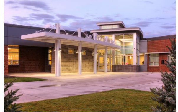
A photo of Shiloh Hills Elementary School