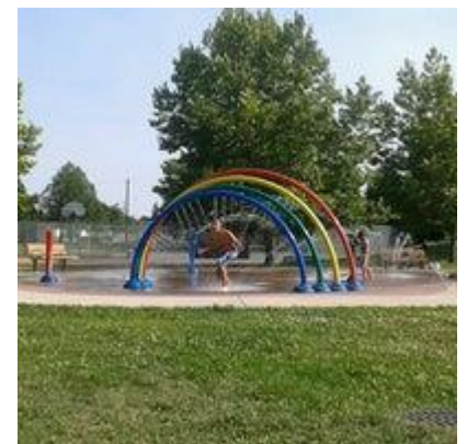
A photo of the splash pad in Friendship Park