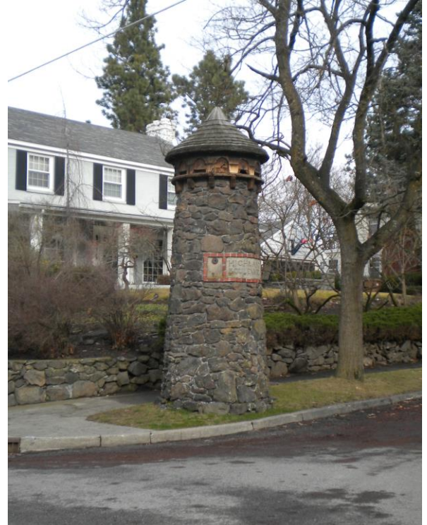
Photo: historic Rockwood stone column, in front of a white house