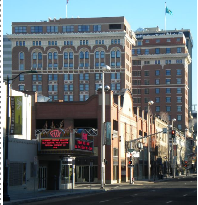
Photo: Fox Theater, adjacent downtown brick buildings, and street