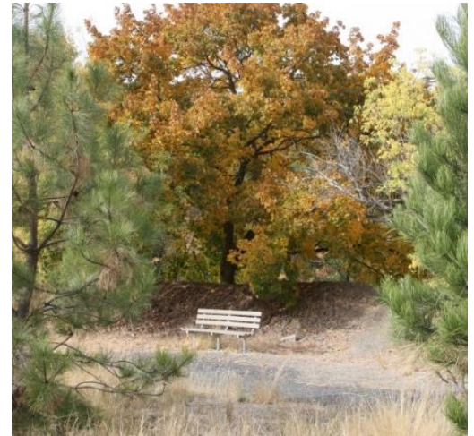
Photo: park bench along a trail with fall and evergreen trees