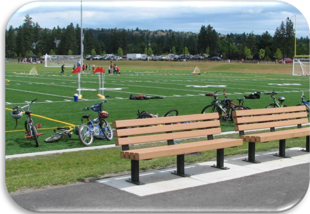
A photo of Dwight Merkel Sports Complex in Northwest Spokane.