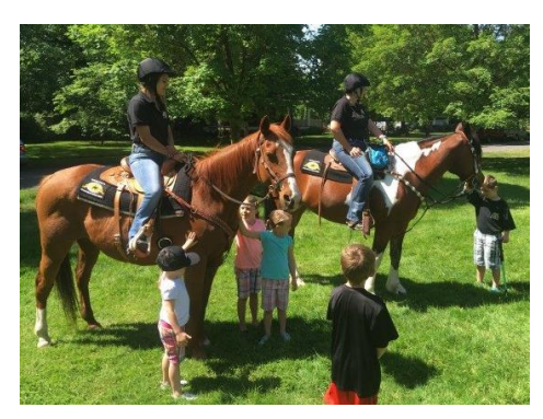
A photo of Spokane C.O.P.S. Mounted Patrol visiting children in a neighborhood park