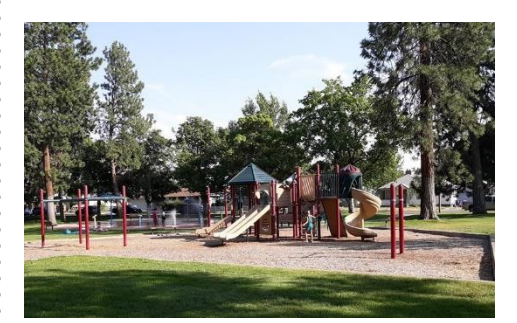
A photo of the playground in Glass Park