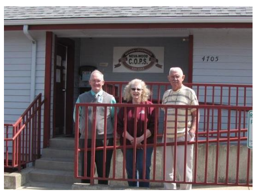
A photo of Neva-Wood C.O.P.S. staff/ volunteers standing in front of their building