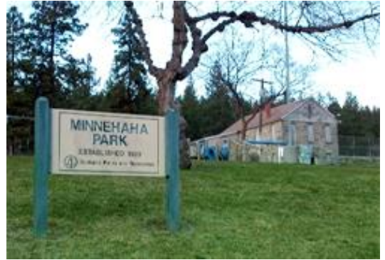
Both photos are of Minnehaha Park, the top photo is the building located inside the park, the bottom photo is of the park signage