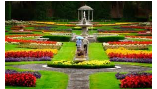
Top photo: Manito Park pond Bottom photo: Duncan Gardens at Manito