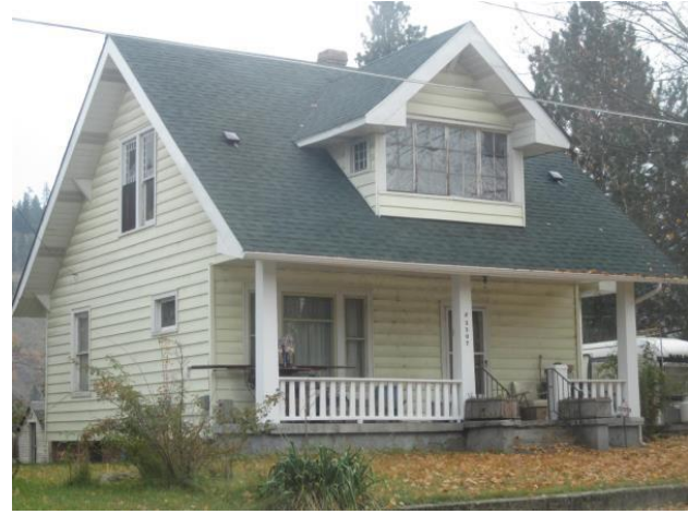
Photo: a yellow house with fall leaves on ground in front