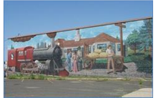
A photo of a painted mural on the side of a building in Hillyard