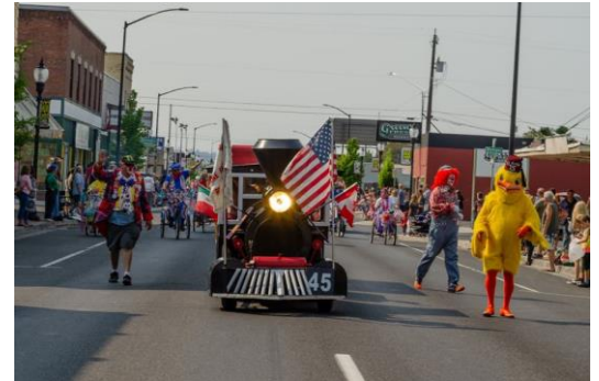
A photo of a train float and people in the Hillyard Parade