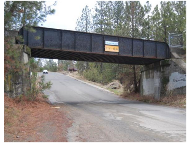
Photo: railway bridge above a street in Grandview/Thorpe