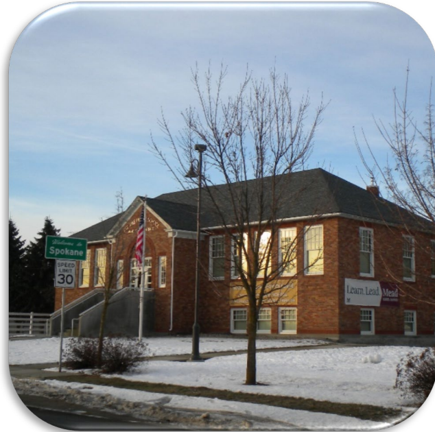
A photo of the Five Mile Prairie Schoolhouse in the Five Mile Prairie neighborhood.