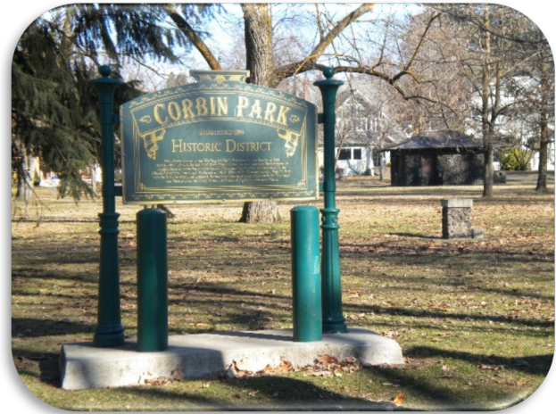
A photo of Corbin Park in the Emerson Garfield neighborhood.