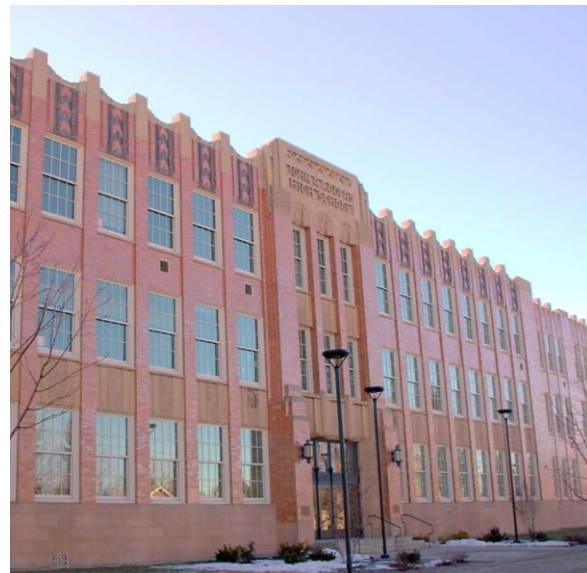
A photo of Rogers High School