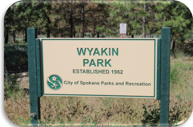
A photo of Wyakin Park in the Balboa/South Indian Trail neighborhood.