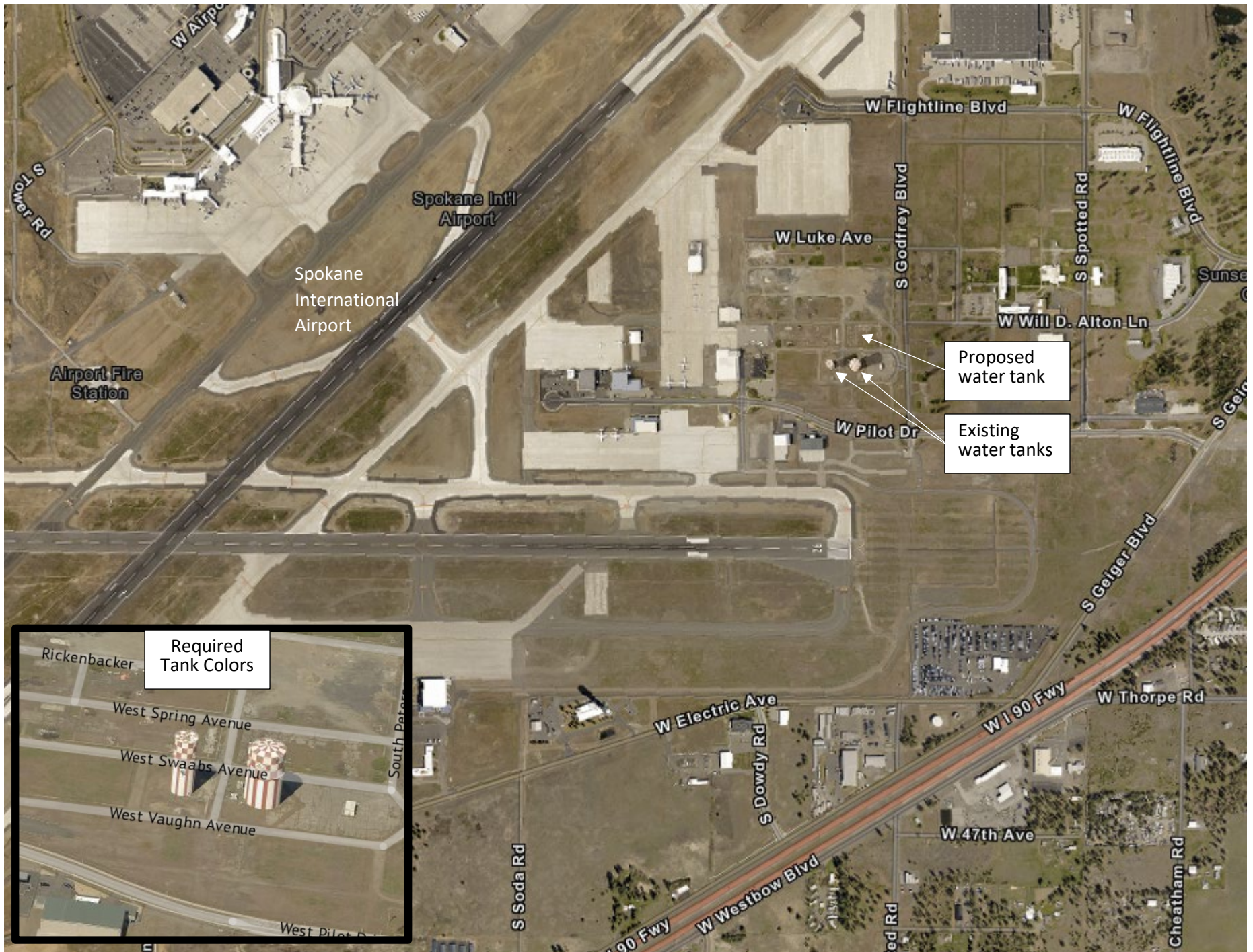
Required Tank Colors