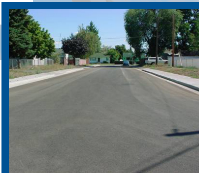
STONE ST. after