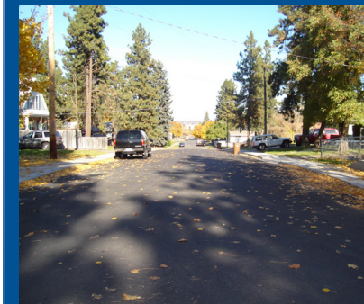
NAPA ST. after