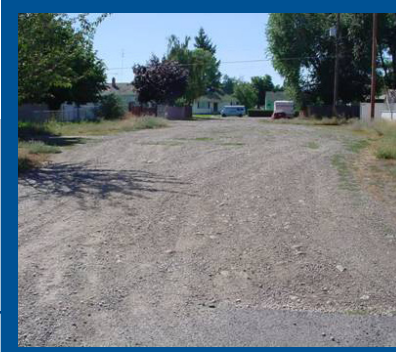
STONE ST. before

LIDs are a legislative means of assisting benefited properties in financing capital improvements through the formation of special assessment districts as defined in RCW 35.43-35.56.