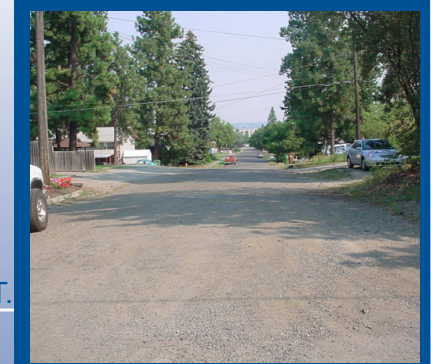
NAPA ST. before