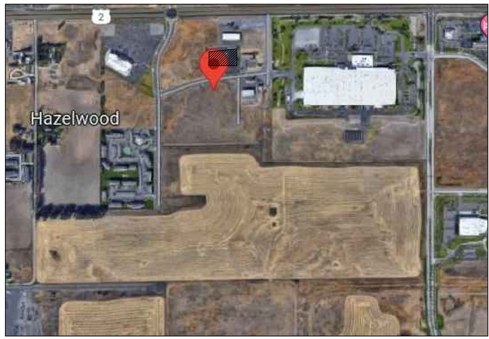
VACINITY MAP N.T.S.

PARCEL: 253010401 1602 S WILLIAMS LN ZONING: LI OWNER: SANDIT BROTHERS, LLC 5515 E 25TH SPOKANE, WA 99223 CONTACT: RUSSELL PAGE ARCHITECTS 104 N DIVISION STE E SPOKANE, WA 99202 509-467-9148 PARKING: REQUIRED: 1 PER 1000 FIRST 3000 1 PER 3500 AFTER + 6 MAX: 1200 + 60 PROVIDED: 23 OCC. CLASSIFICATION: 5-11 F-11 CONSTRUCTION TYPE: VB