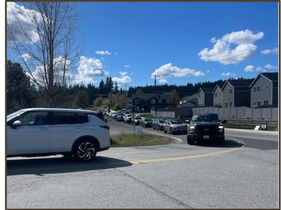
A photo of motor vehicles queued on the street in a residential area, on a partly cloudy spring day.