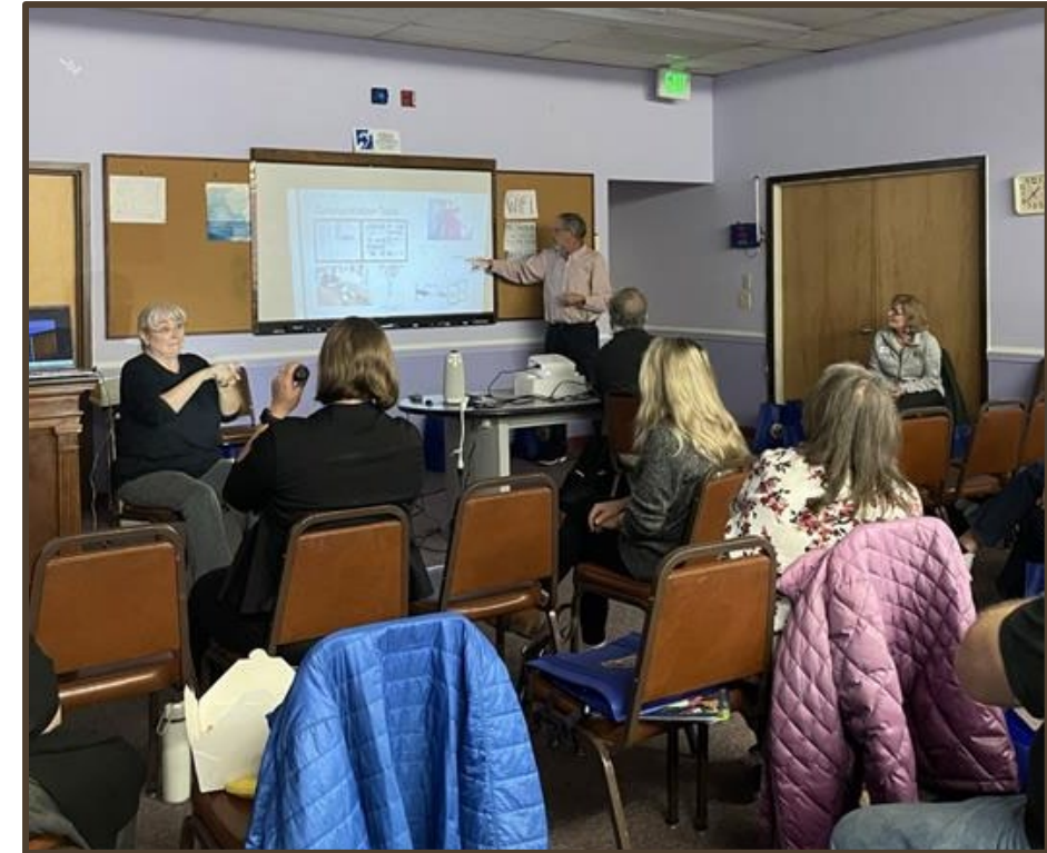
An audience seated inside a building, observing a presentation by a standing speaker accompanied by a seated American sign language interpreter.