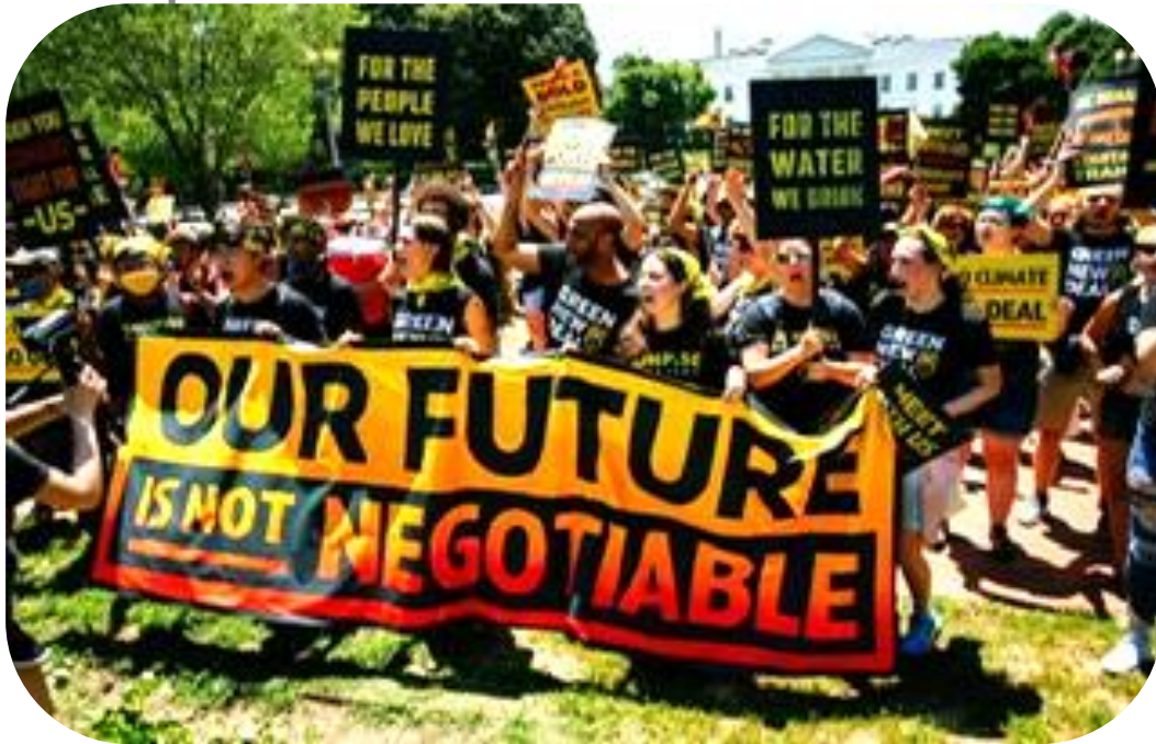
Spokane youth at Sunrise Movement Climate Action in Washington DC, June 2021