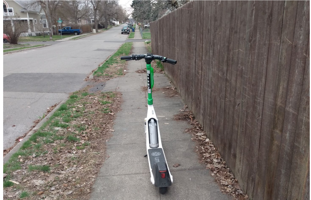
Example of an improperly parked scooter.

Doubled number of warnings and fines for improperly parked scooters/bikes or bad ridership.