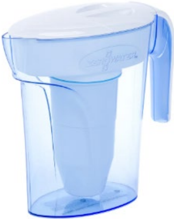
Fill Station Containers