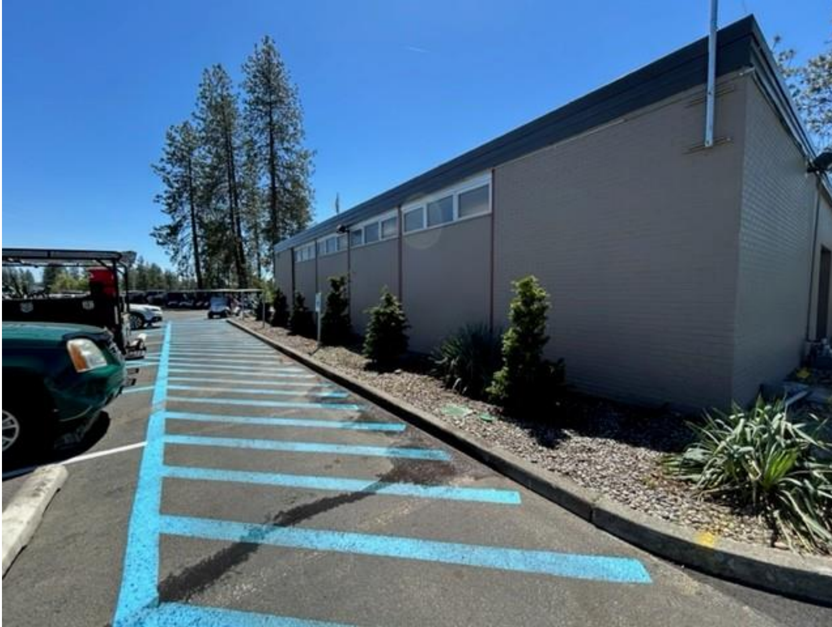
Downriver Clubhouse tree replacements