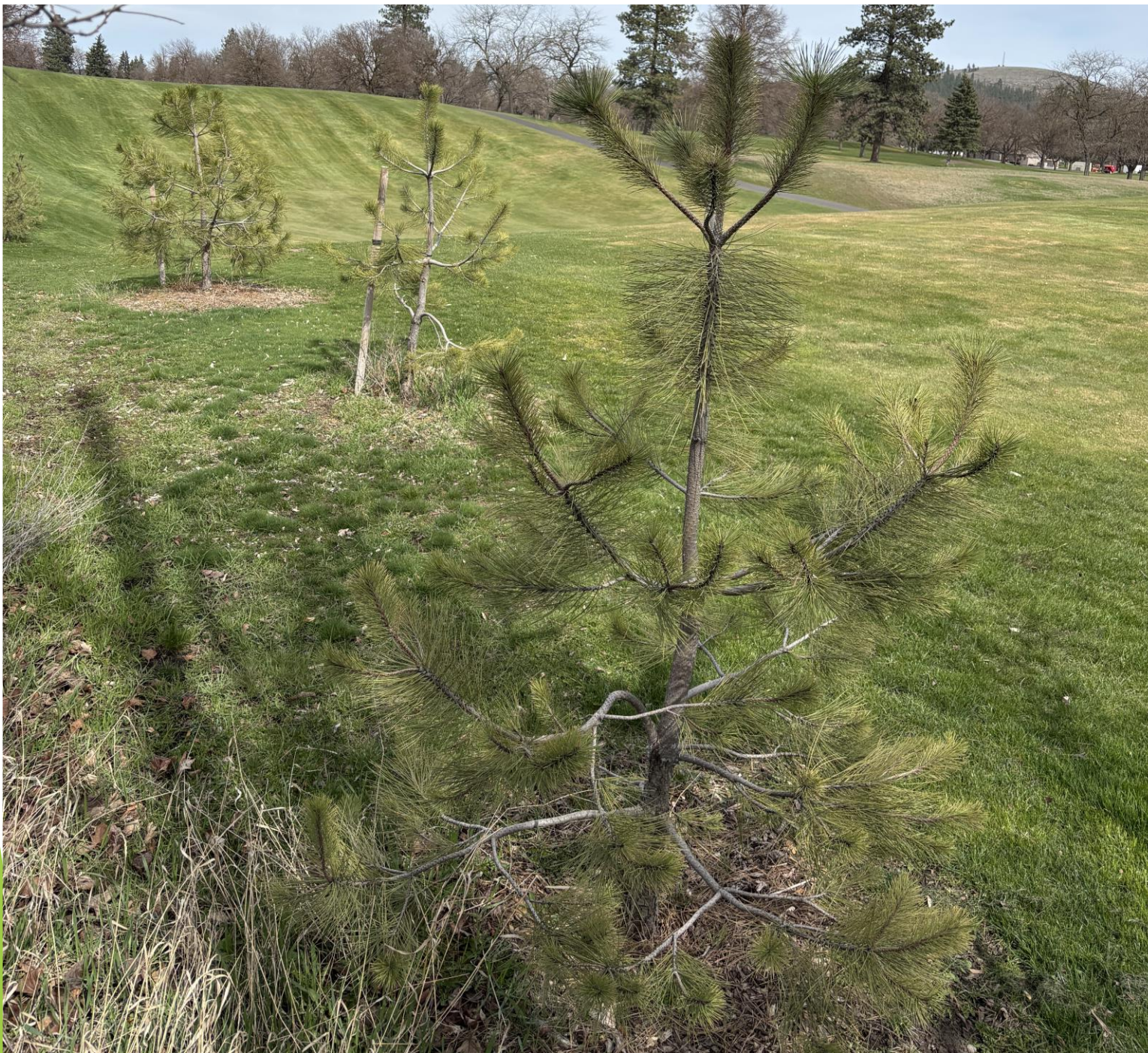
Esmeralda 5 ponderosa pine planted on course