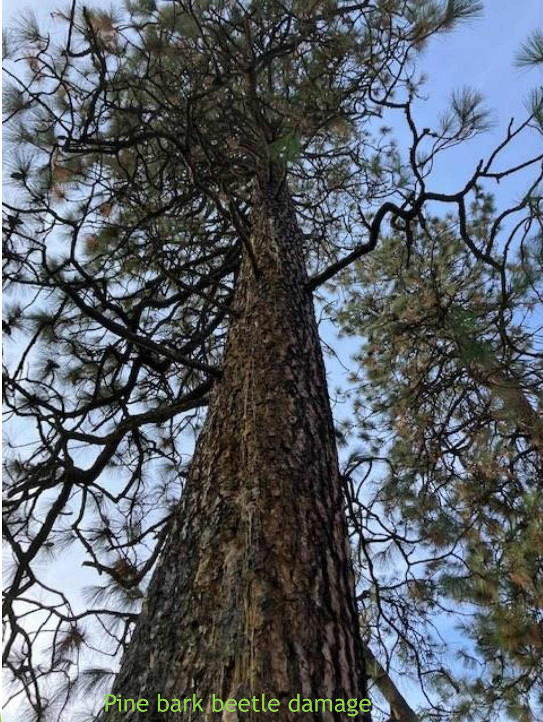
Pine bark beetle damage

In 2025 UF started taking a more aggressive approach to managing beetle infestations