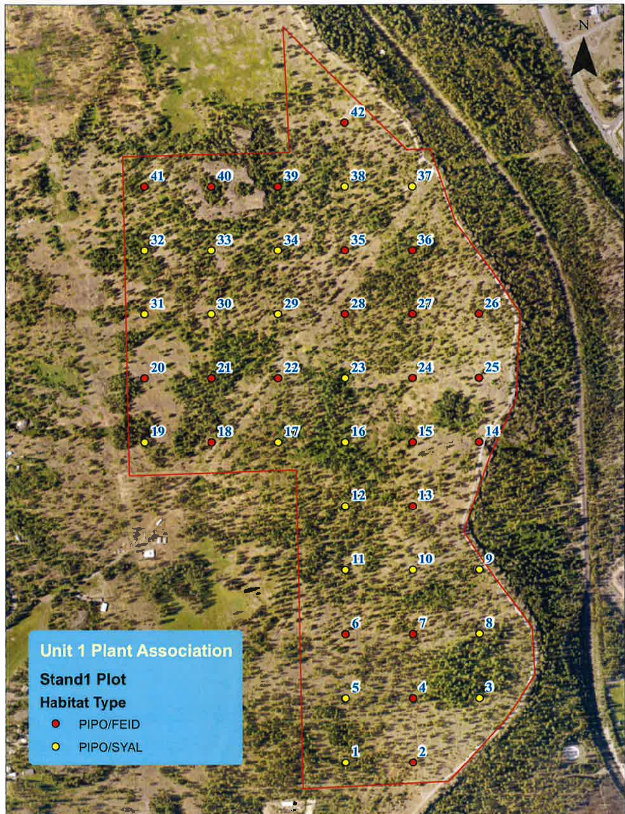
Figure 3: Unit 1 Habitat Type