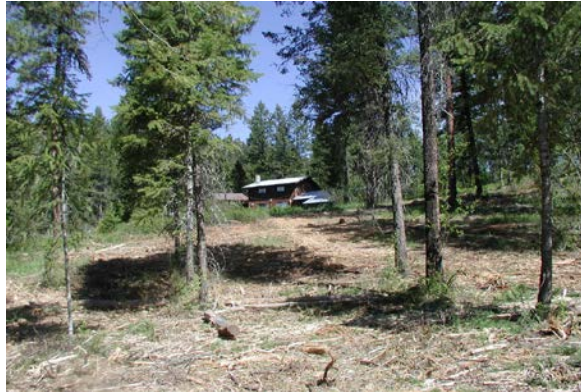
POST TREATMENT – 1 WEEK