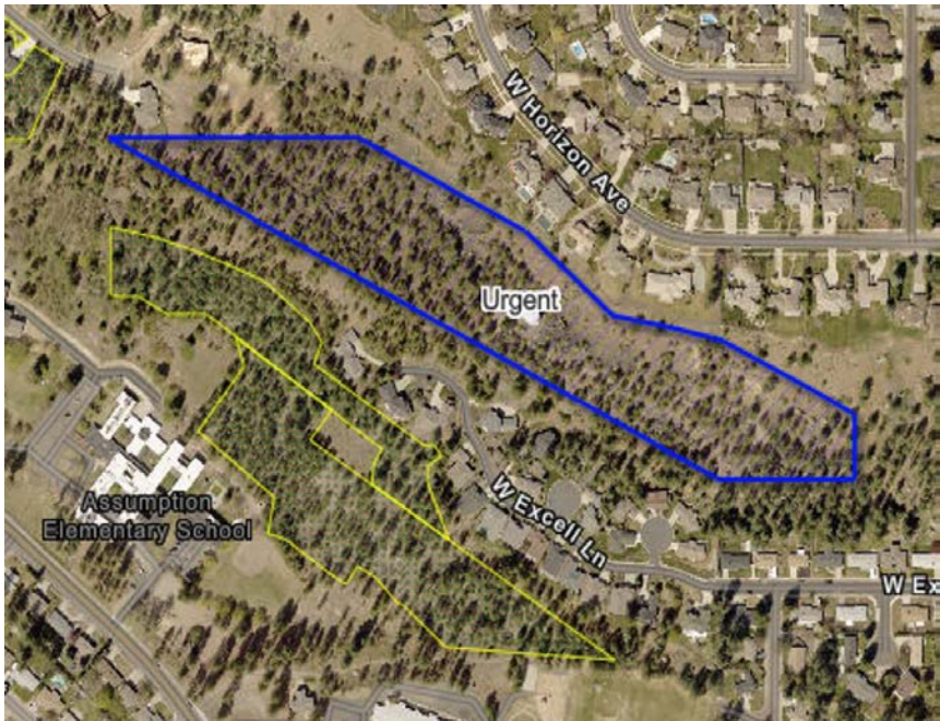
11 acres off Excell lane