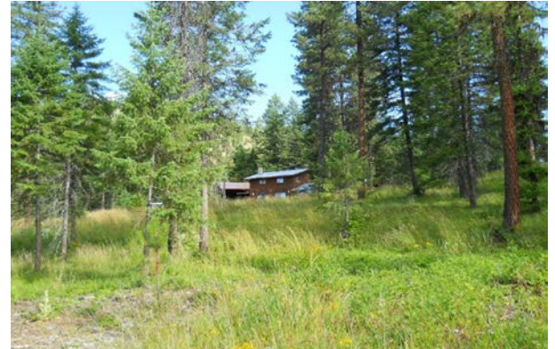
POST TREATMENT – 6 MONTHS