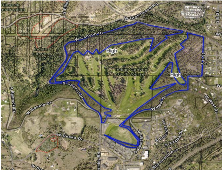
Start 75 acres adjacent of Indian Canyon Golf Course