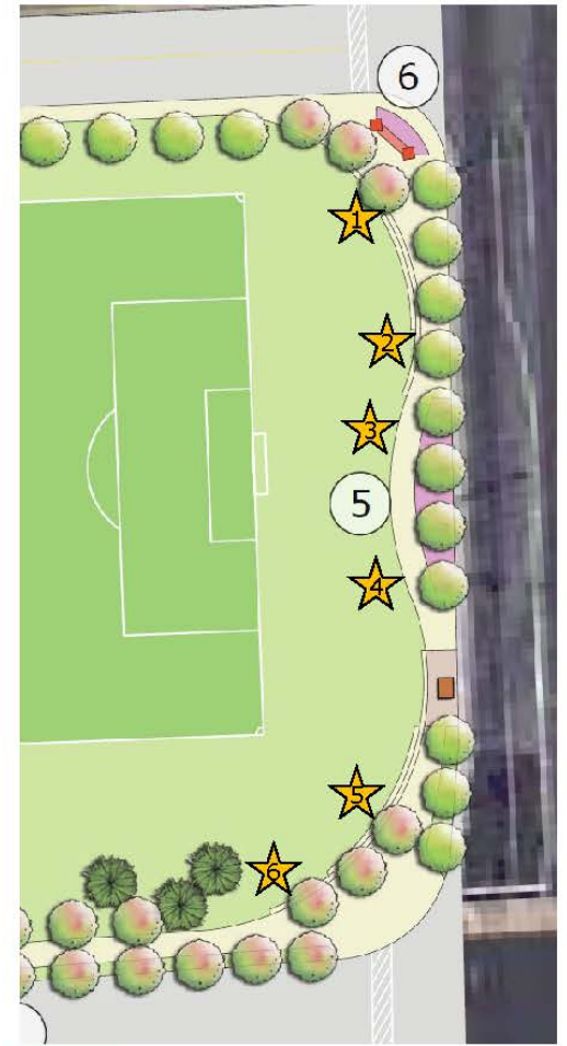
Linear Skate Element