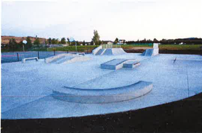
Example 3: Kandle Park skate dot, Tacoma, WA

Example 2: Liberty Lake skatepark, WA, $180,000