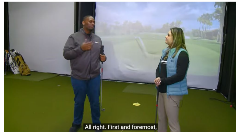
Spokane golf instructors ready for a busy season