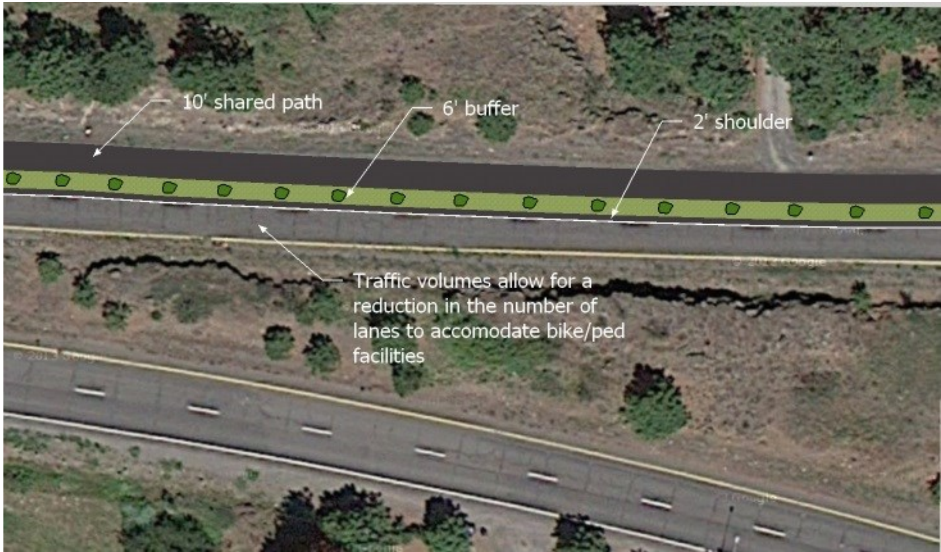
Concept 7. Sunset HWY One Lane and Shared Use Path. (section shown west of Basalt & Sunset HWY)