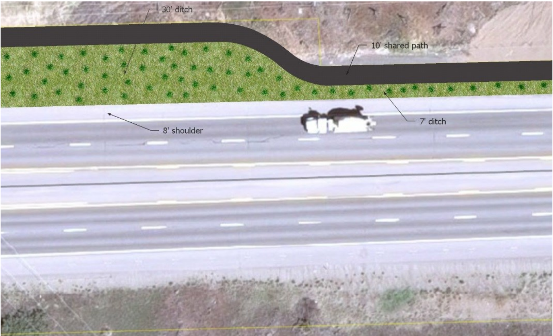
Concept 6. Bike & Ped Connection to Sunset Blvd. (section shown east of Spotted Rd & HWY 2)