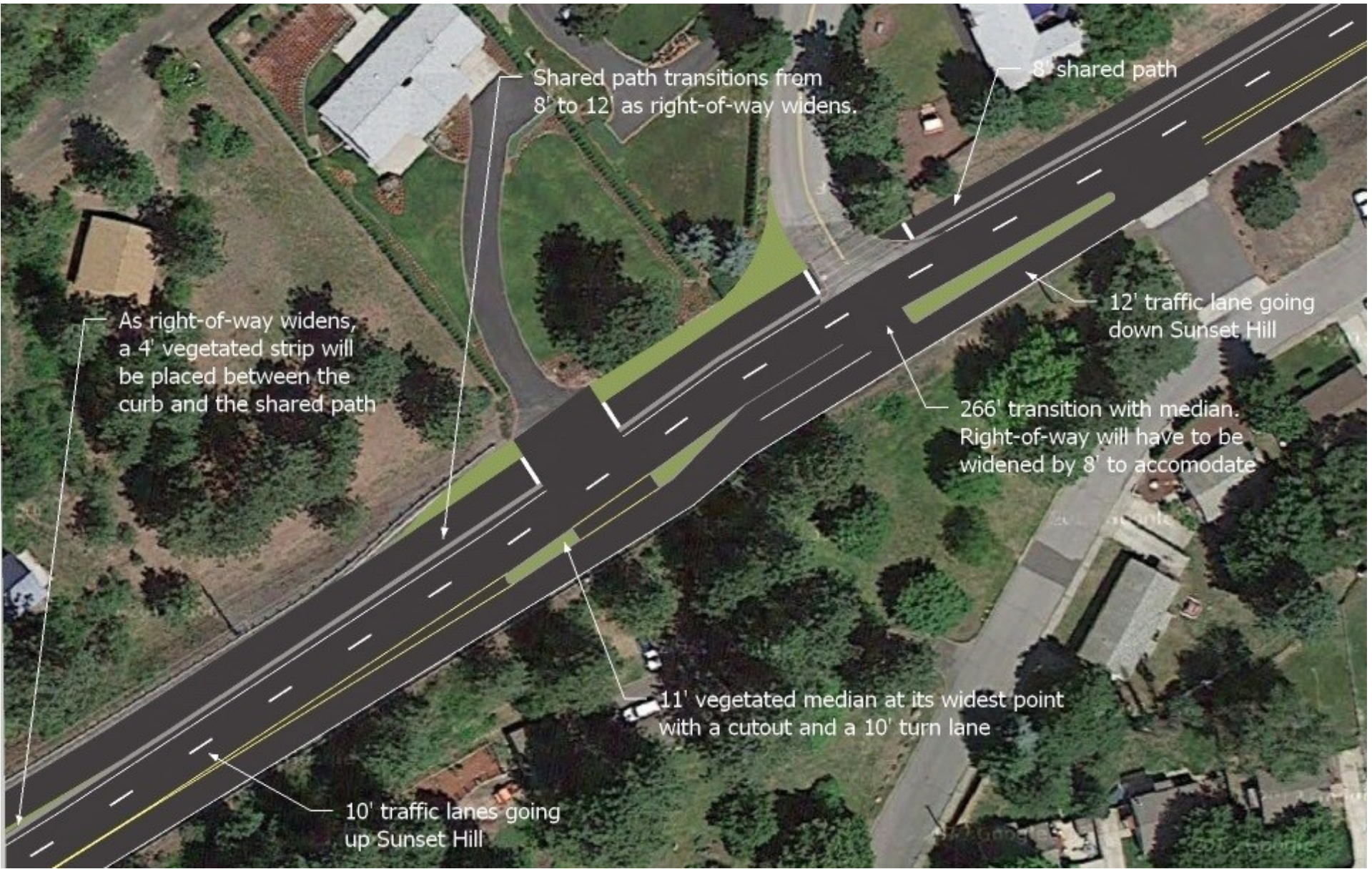
Concept 9. Sunset Blvd Road Diet and Shared Use Path –Curb Separation (section shown at F St & Sunset Blvd)