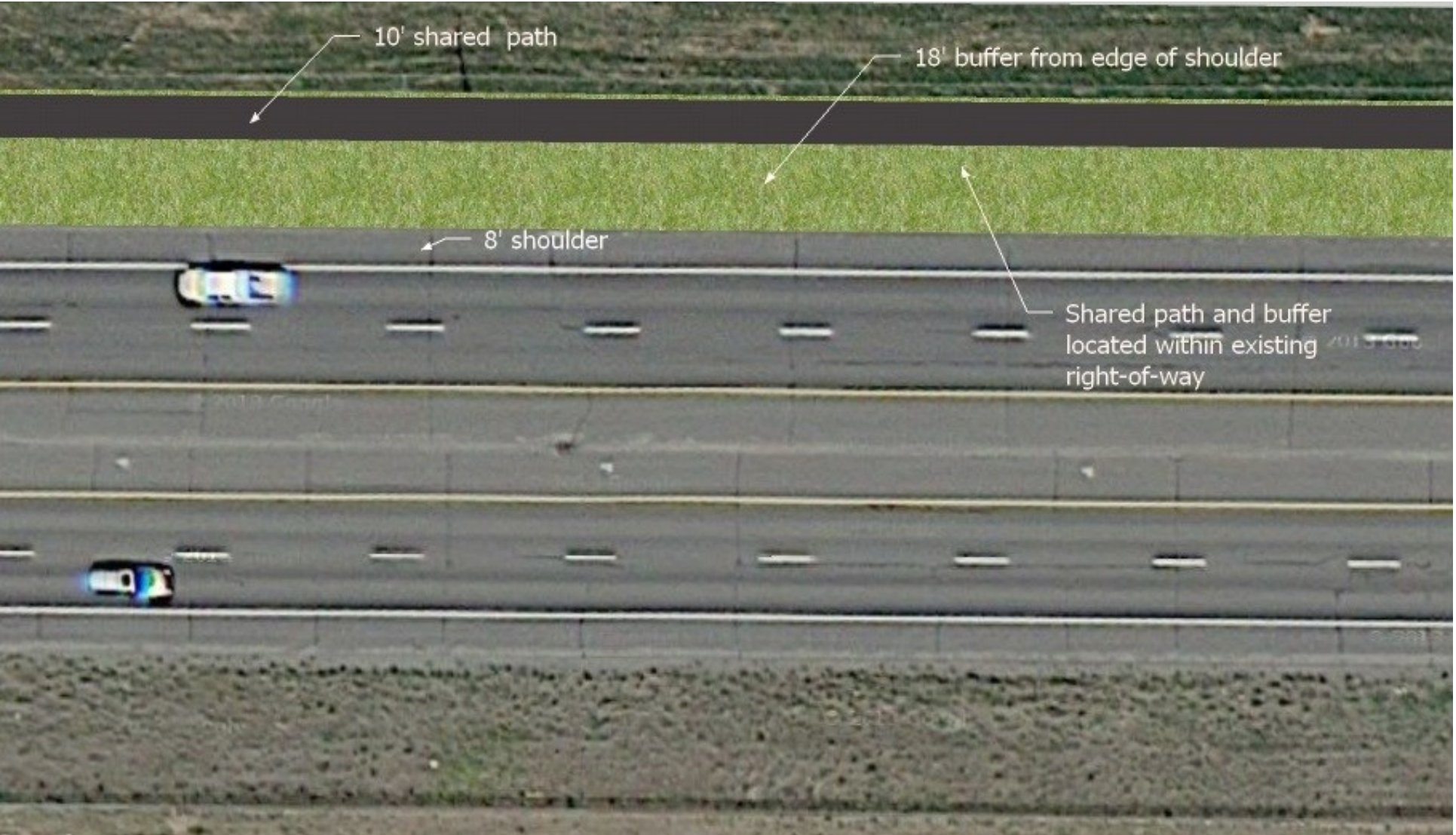
Concept 1. Shared use path along the north side of HWY 2 from the Spokane Tribe Economic Project to Fairchild Air Force Base gate