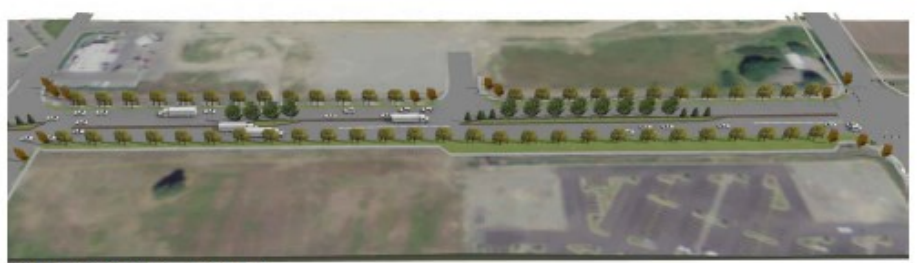
CONCEPT GRAPHIC: EAST END