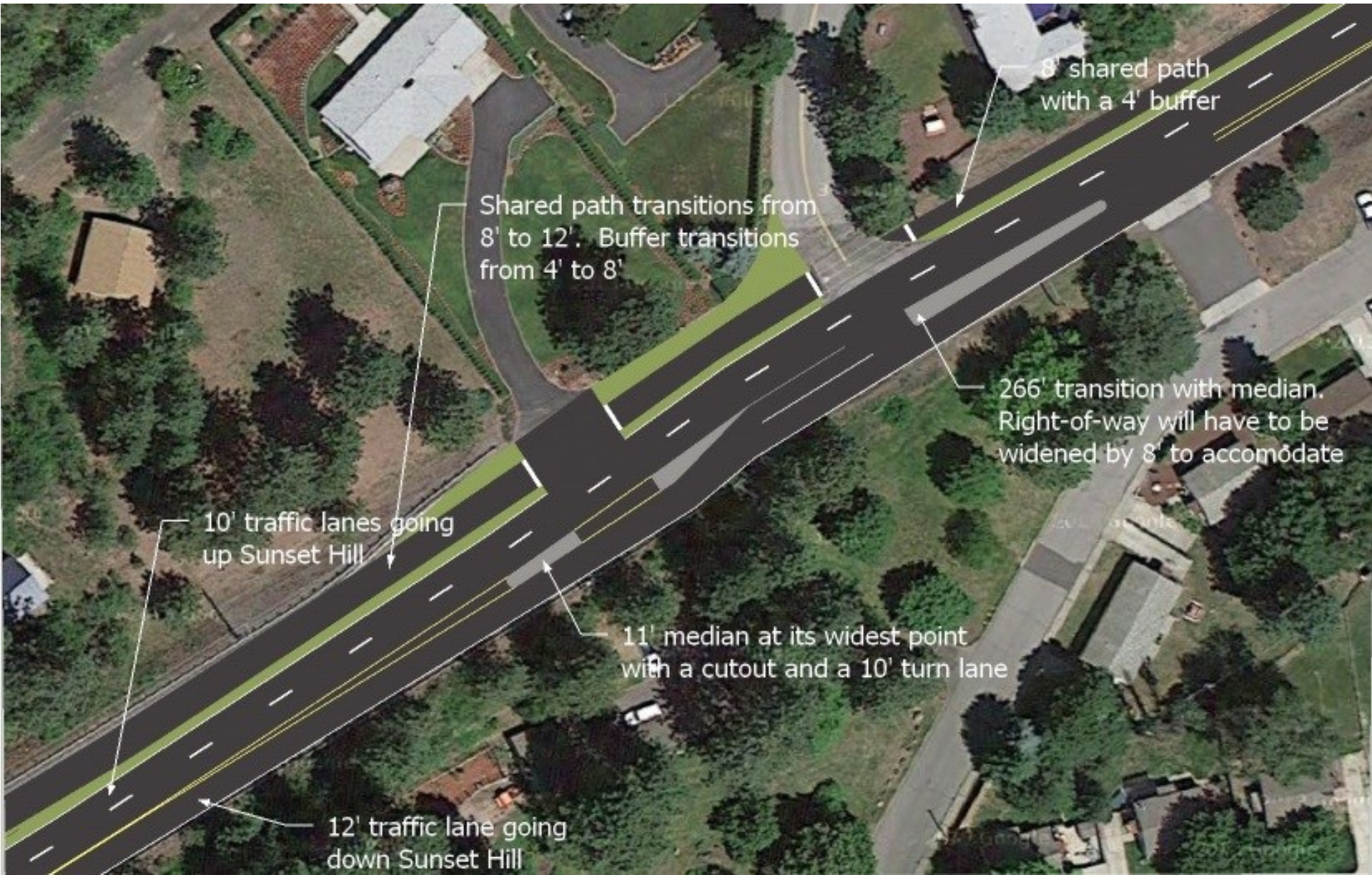
Concept 8. Sunset Blvd Road Diet and Shared Use Path –Vegetated Buffer (section shown at F St & Sunset Blvd)