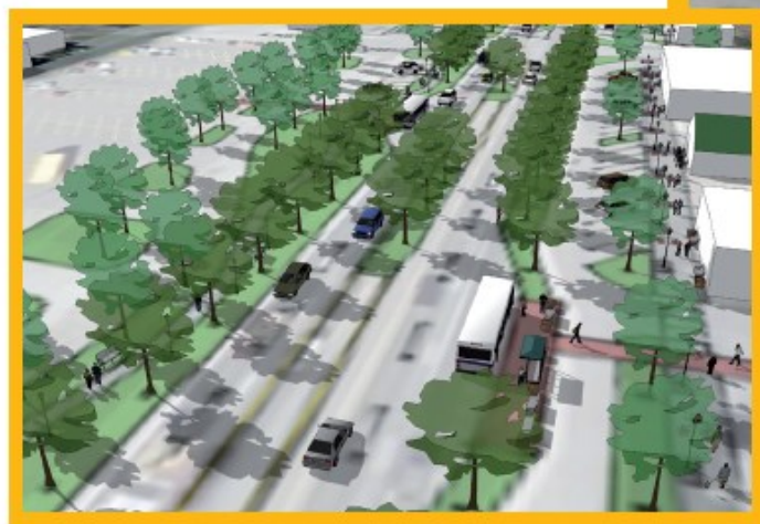
Model images above illustrate trees after 15-20 years of growth.