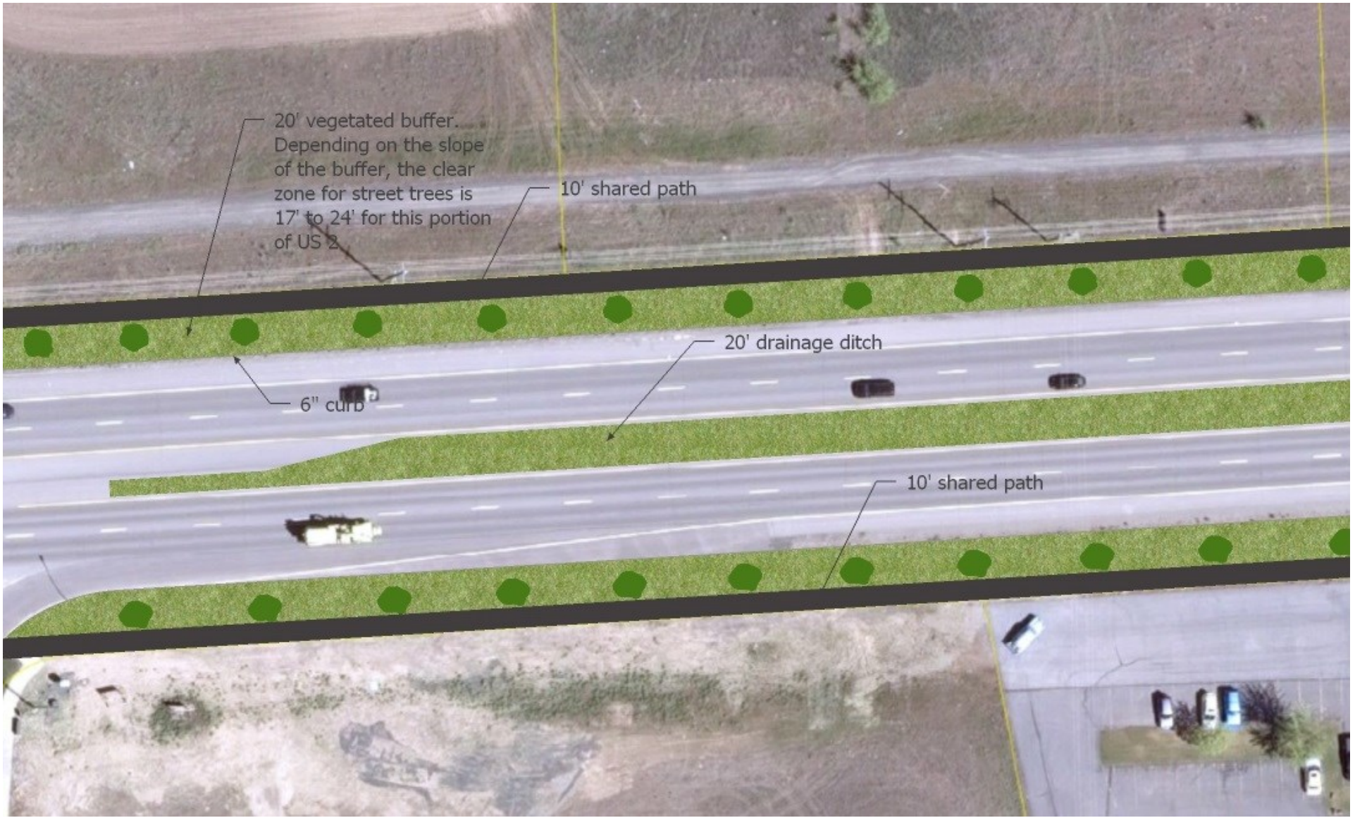
Concept 5. West Spokane HWY 2 Urban Industrial Corridor Shared Use Paths (section shown at Deer Height Rd & HWY 2)