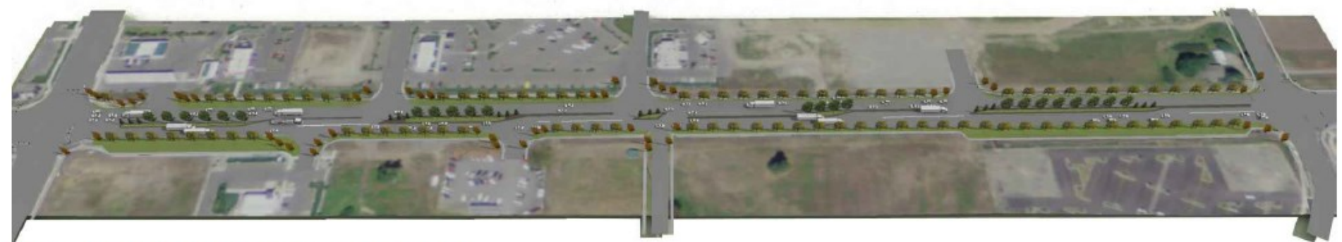
HIGHWAY 2 CONCEPT GRAPHIC: HAYFORD ROAD TO DEER HEIGHTS ROAD