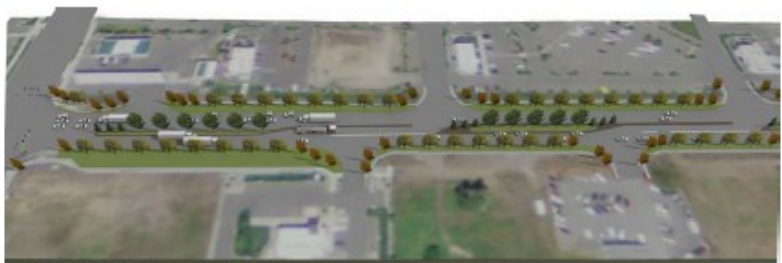
CONCEPT GRAPHIC: WEST END