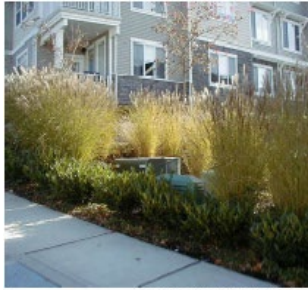
Screening by wall and planting