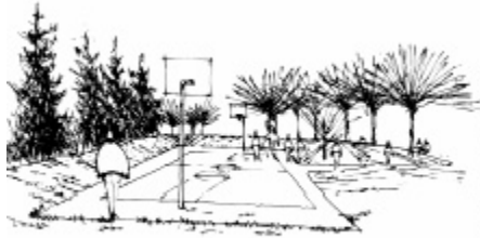
Basketball court provided in common outdoor area